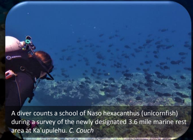
A diver counts a school of Naso hexacanthus (unicornfish) during a survey of the newly designated 3.6 mile marine rest area at Ka'upulehu. C. Couch