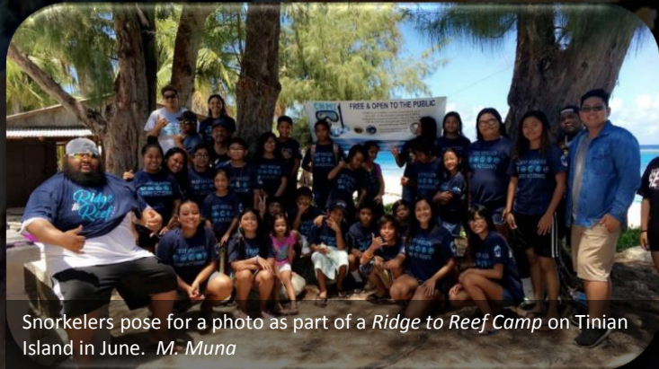
Snorkelers pose for a photo as part of a Ridge to Reef Camp on Tinian Island in June.