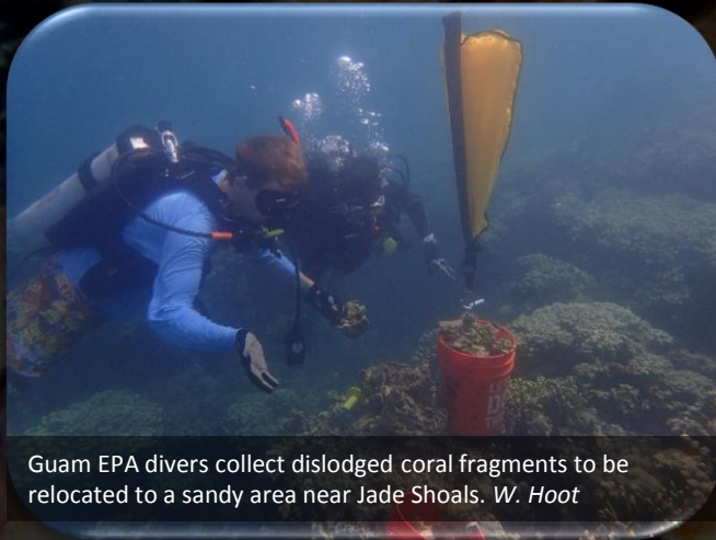
Guam EPA divers collect dislodged coral fragments to be relocated to a sandy area near Jade Shoals.

The Our Florida Reefs Community Planning Process resulted in 68 Recommended Management Actions for southeast Florida's reefs..