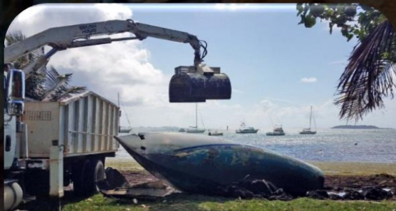
Derelict vessels being removed from the Fajardo coast as part of activities funded under NOAA Marine Debris Program grant.