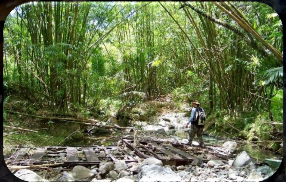
Removal of Bamboo is an essential component of restoring watersheds in Guam. A. Simeon.