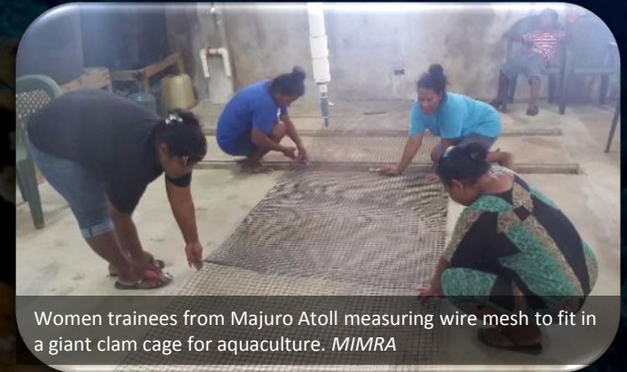
Women trainees from Majuro Atoll measuring wire mesh to fit in a giant clam cage for aquaculture.